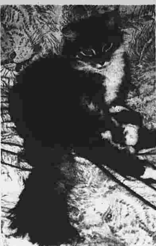
SITTING COMFORTABLY gentle "Kelly" needs home